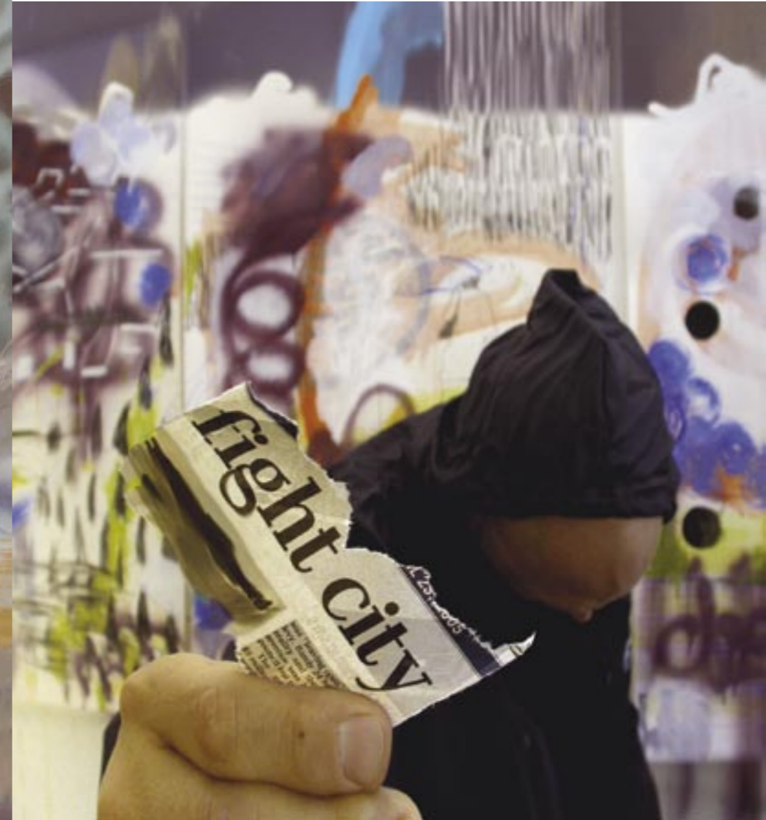
Untitled. Photographic lambda print on aluminium, 50 x 50, 2005.