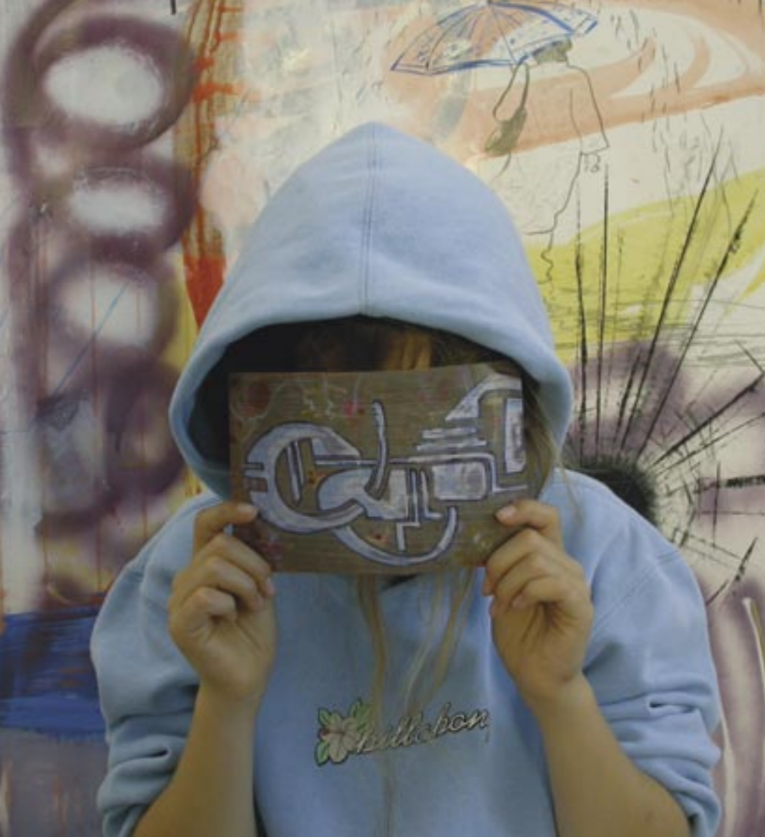
Untitled. Photographic lambda print on aluminium, 50 x 50, 2005.